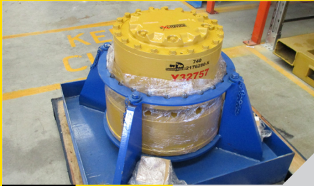
2176290 WHEEL GP - FRONT