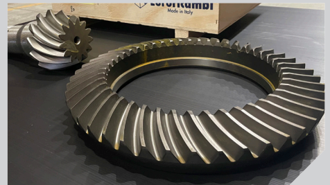
3619411 GEAR SET