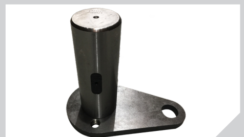
1421227 PIN BODY MOUNT