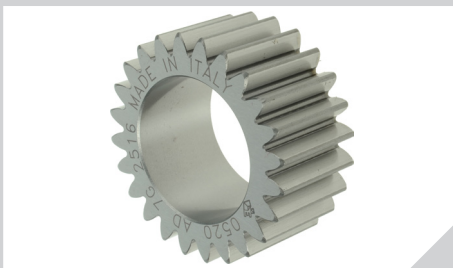
7G2516 GEAR - PLANETARY