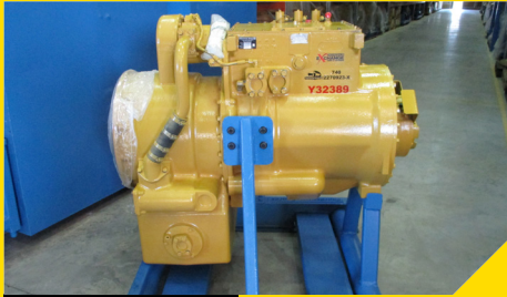
2270923 & 1466225 TRANSMISSION