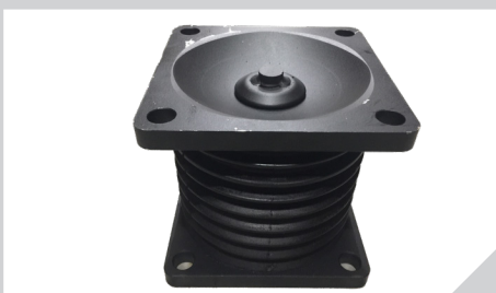
2114987 MOUNT - SUSPENSION