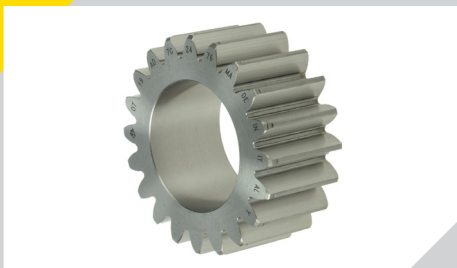
7G2476 GEAR - PLANETARY