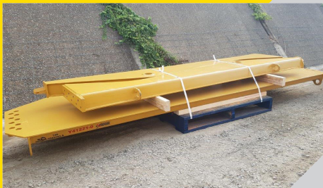
3045455 TAILGATE & MOUNTING KIT