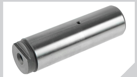
1903593 SHAFT - PLANETARY