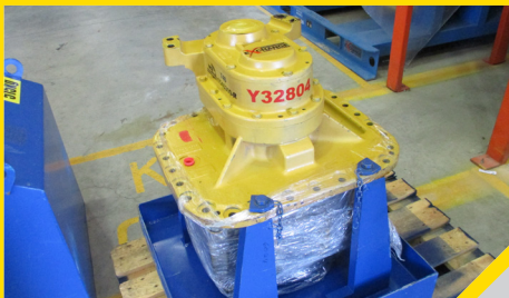
1540300 & 1487200 DIFF GP