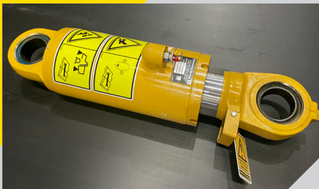
3414124 CYLINDER GP - FRONT STRUT