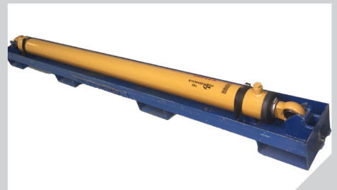
2854034 CYLINDER GP - HOIST