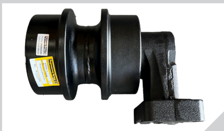
4638433 ROLLER GP UPPER