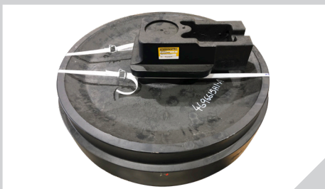
4696615 IDLER GP