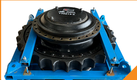
9245044 FINAL DRIVE TRAVEL DEVICE