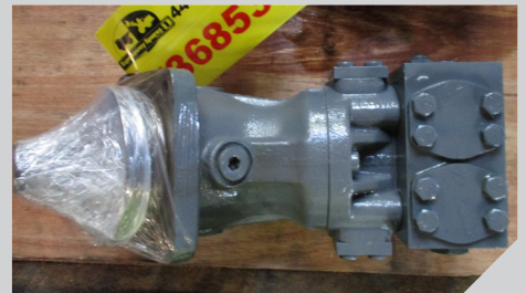
4438786 MOTOR GP FAN OIL COOLER