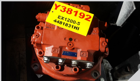
4481831 MOTOR GP TRAVEL