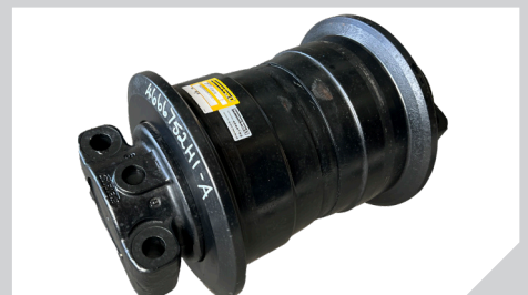
4666752 ROLLER GP LOWER