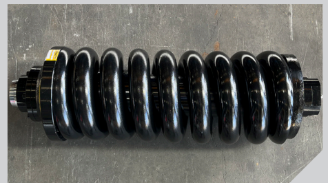
9271451 TRACK ADJUSTER