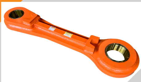
9280779 & YA60047270 I LINK