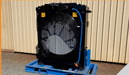
YA60020986 RADIATOR GP