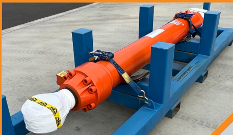
4682480 CYLINDER GP