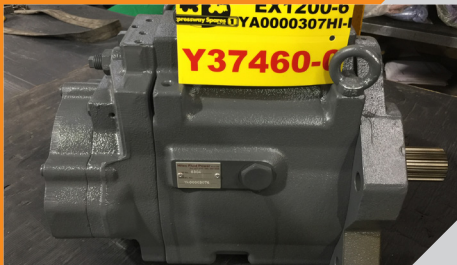
YA00003076 PUMP GP MAIN