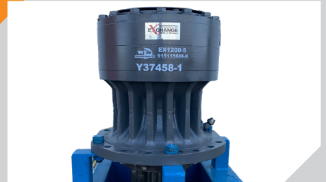
9151156 SLEW BOX SWING DEVICE