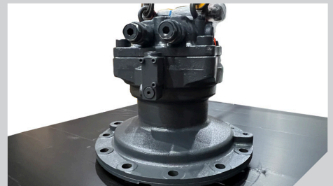
4668923 MOTOR GP SLEW